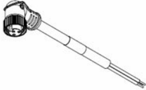
Series image - Reference only

Status: Active Series: 130006 Category: Molex Parts Engineering/Old PN: 105003A03F060